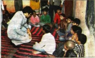
एचपीएन बाल अधिकार सेक्टर अग्रा के सदस्य बच्चों से उनका हालचाल जानने हुए।

अग्रा (11 March): 'सा दिन बोल गए, न एक मिली और ना ही दर्द काम हुआ, ये उन 60 बच्चों का दर्द है जिसको तस्वीरों के खिलाफ के पान ने असा ज़रूर था, बच्चों की मुस्कान पर कसूर तो का मिल गया, लेकिन आरोपियों को छोड़ दिया गया, बंदे को सफल पर संभल लेते हुए एचपीएन बाल अधिकार सेक्टर अग्रा ने बच्चों का हलाक और लापरवाह अधिकारियों को बड़ी फटकार लगाई, साथ ही संबंधित अधिकारियों से ट्यूबों खोल कर हर हाल में पेशे में मान्य बनें को कहा वही।